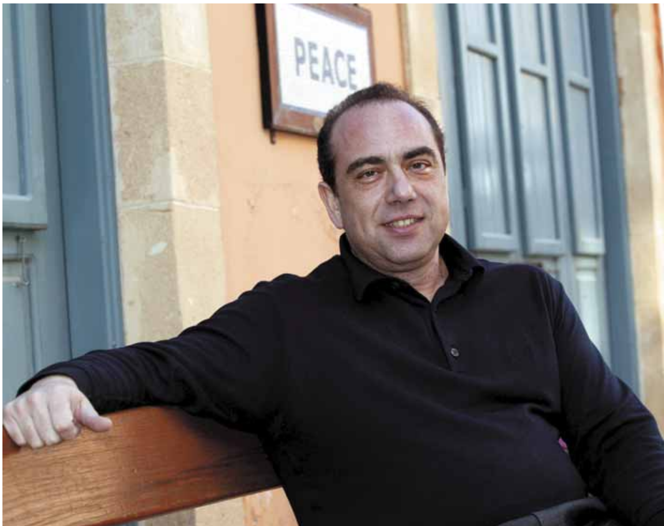
Markos Kyprianou. The first commissioner to come from newly joined Cyprus, Kyprianou worries that many of the new Member States put too little money into healthcare, while they also suffer some of the highest rates of cancer

on tobacco advertising and sponsorship, a ban on misleading tobacco labelling and mandatory health warnings on all tobacco packs.