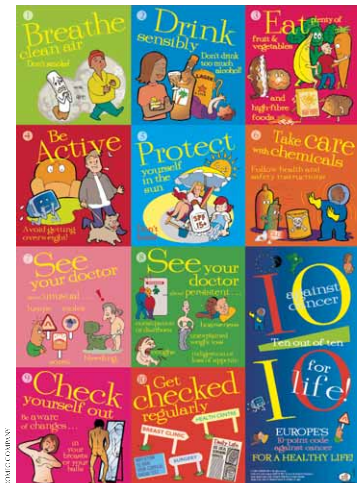
Europe's 10-point Code Against Cancer. This poster was produced in 1997 as part of a UK public health campaign within the framework of the Europe Against Cancer programme. The European Code Against Cancer was updated in 2003, but it is no longer being promoted so effectively

of more effective screening programmes for breast, cervical and colorectal cancer was established as a political priority by the Commission. Member States are currently working to implement these recommendations and improve cancer screening. The Commission lends support to its implementation by the parallel development of better and more comprehensive EU guidelines on best practice in cancer screening. The fourth edition of guidelines for breast cancer and the first edition of guidelines for cervical cancer are expected to be published later this year. Guidelines for best practice in colorectal cancer